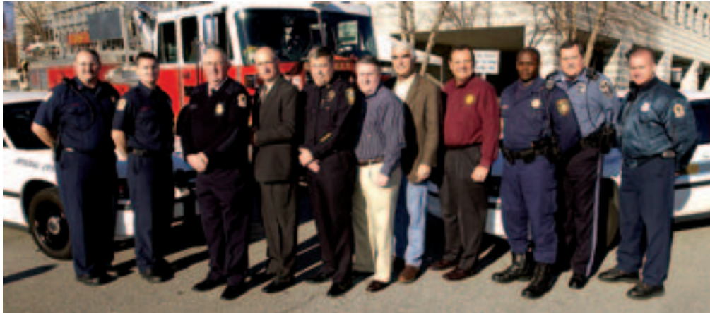
The Fire and Police Chiefs of Gwinnett County join together with the Gwinnett Chamber of Commerce in paying tribute to Gwinnett's public safety professionals.

In the spirit of giving back to the community, The Gwinnett Chamber of Commerce will present the county's first-ever Valor Awards in March 2006.