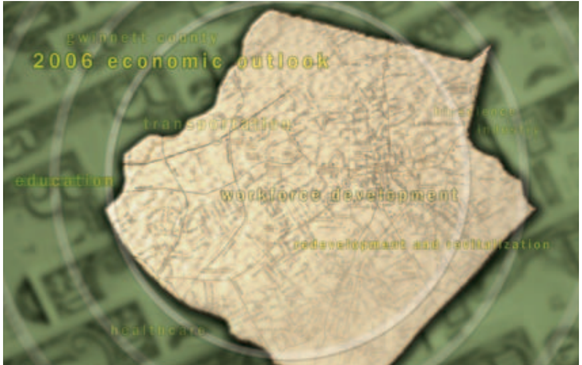
Gwinnett's largest and most respected economic outlook event promises to offer the most complete local picture for 2006.

PRSRRT STD U.S. POSTAGE PAID ATLANTA, GA PERMIT NO. 349