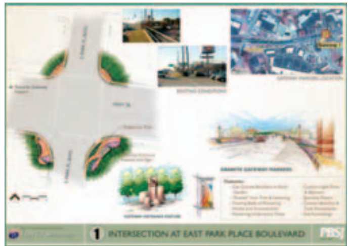
Node/Gateway 1 Concept – Intersection at East Park Place Boulevard.

The Highway 78 CID employs a landscaping service that each week cuts grass along both sides of the 7-mile section of the highway within the jurisdiction, removing approximately 25 bags of trash along the way. The organization provides a security team composed of off-duty Gwinnett police officers who patrol the corridor looking to stop security threats ranging from unlocked doors to malfunctioning security gates. The officers are also available to respond to any incidents that may occur.